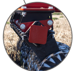
Simple depth adjustment