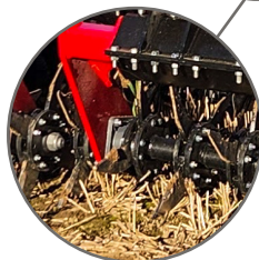
Heavy duty multi-sealed bearings