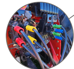
Colour-coded hydraulic couplings